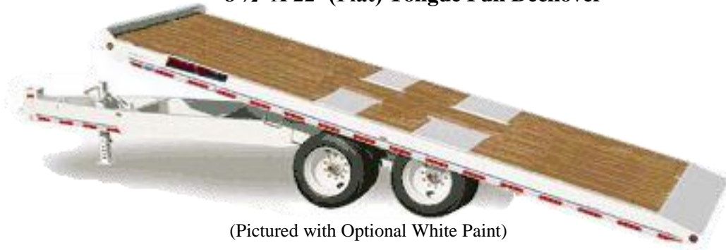
(Pictured with Optional White Paint)